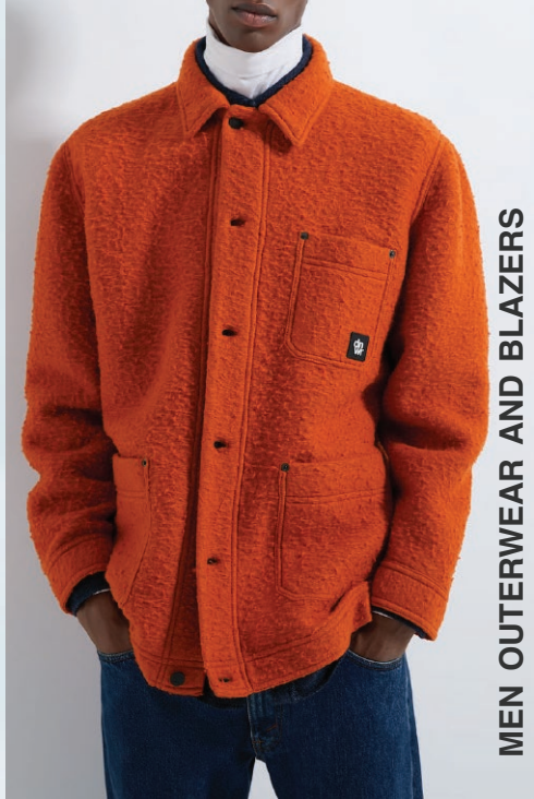
MEN OUTERWEAR AND BLAZERS