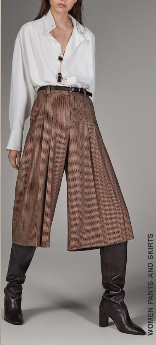
WOMEN PANTS AND SKIRTS