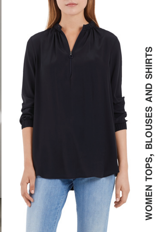
WOMEN TOPS, BLOUSES AND SHIRTS