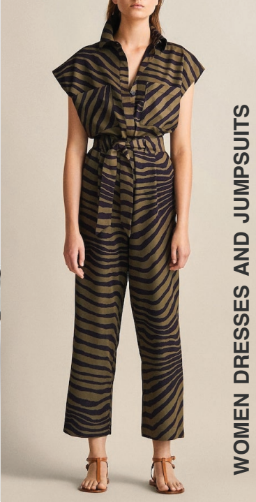
WOMEN DRESSES AND JUMPSUITS